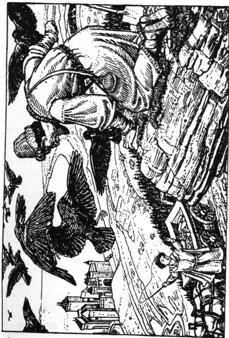
THE GOLDEN MOUNTAIN.